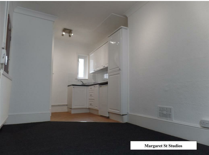
Margaret St Studios

These particulars, whilst believed to be accurate are set out as a general outline only for guidance and do not constitute any part of an offer or contract. Intending purchasers should not rely on them as statements of representation of fact, but must satisfy themselves by inspection or otherwise as to their accuracy. No person in this firms employment has the authority to make or give any representation or warranty in respect of the property.